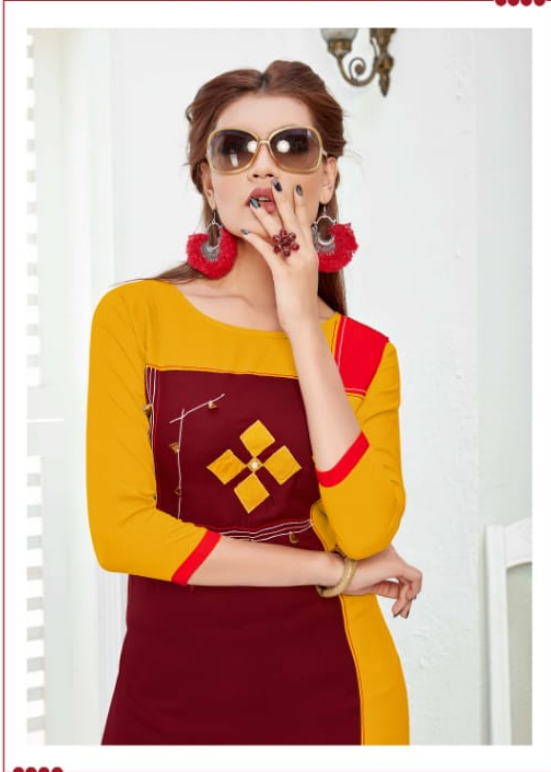
D.No.1005 Rule the kingdom of beauty with our range of artistic an sensual collection