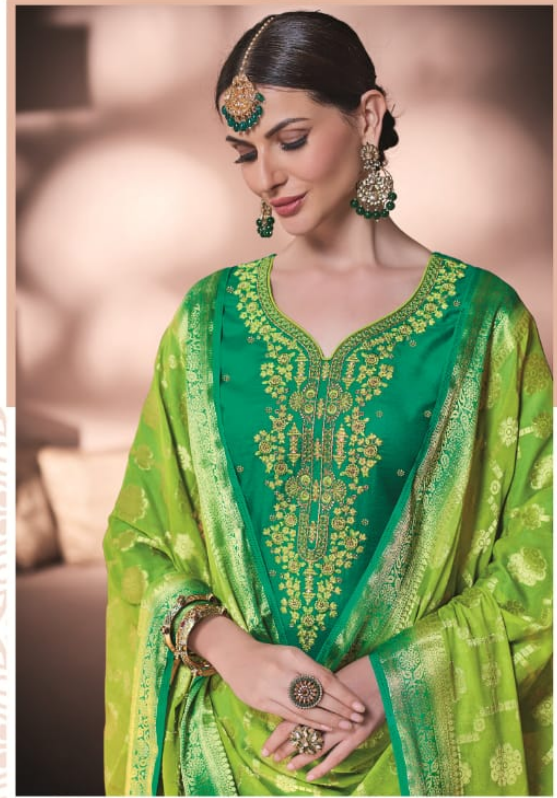
The essence of beauty and elegance wrapped altogether.