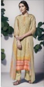
D.NO :- 7336