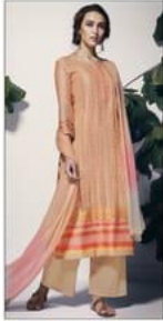
D.NO :- 7335