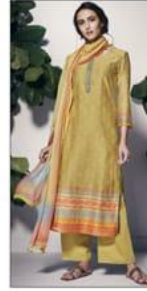
D.NO :- 7338