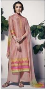
D.NO :- 7331