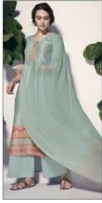
D.NO :- 7332