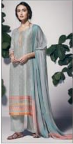
D.NO :- 7334