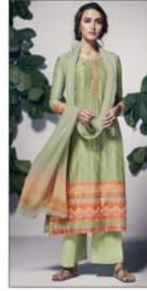
D.NO :- 7337