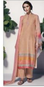
D.NO :- 7339