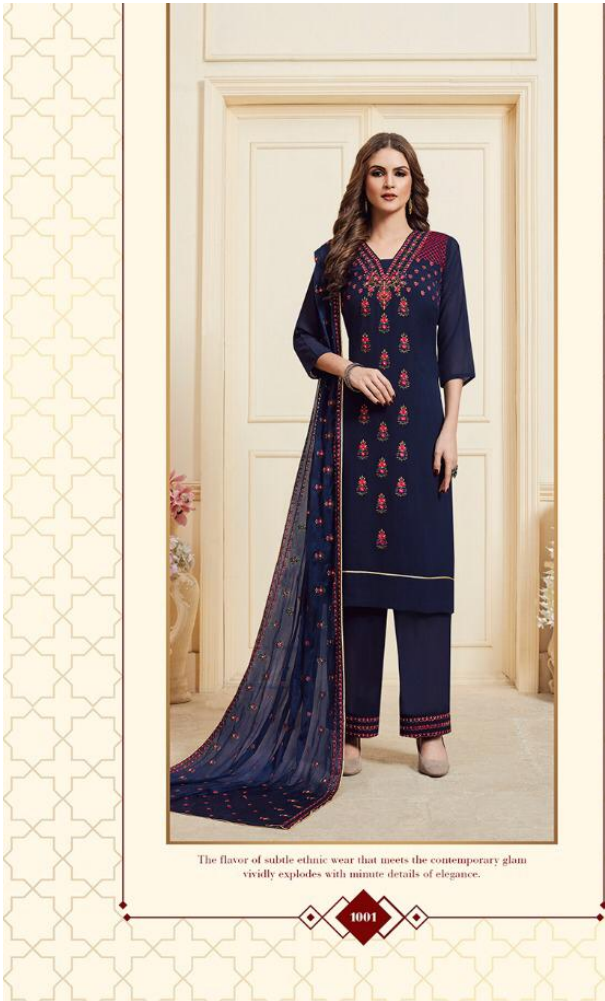
The flavor of subtle ethnic wear that meets the contemporary glam vividly explodes with minute details of elegance.