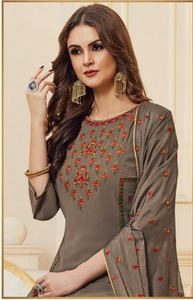
Get dazzled with vivacious colors of India and bring out the ethnic side of you with this beautifully crafted piece.